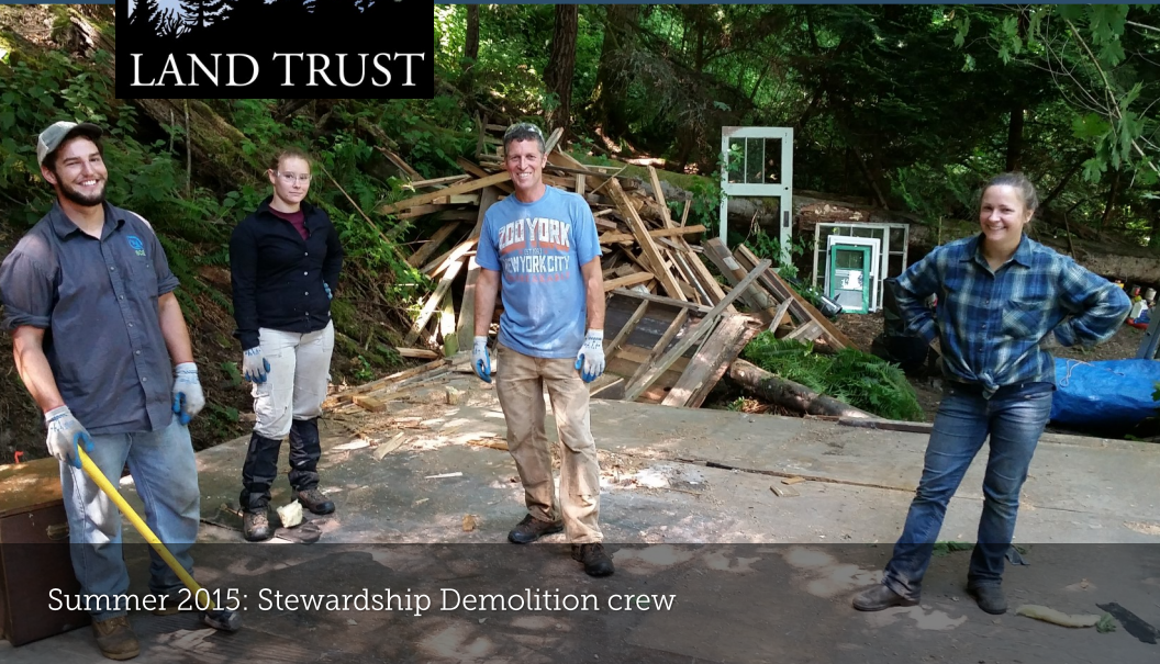
Summer 2015: Stewardship Demolition crew