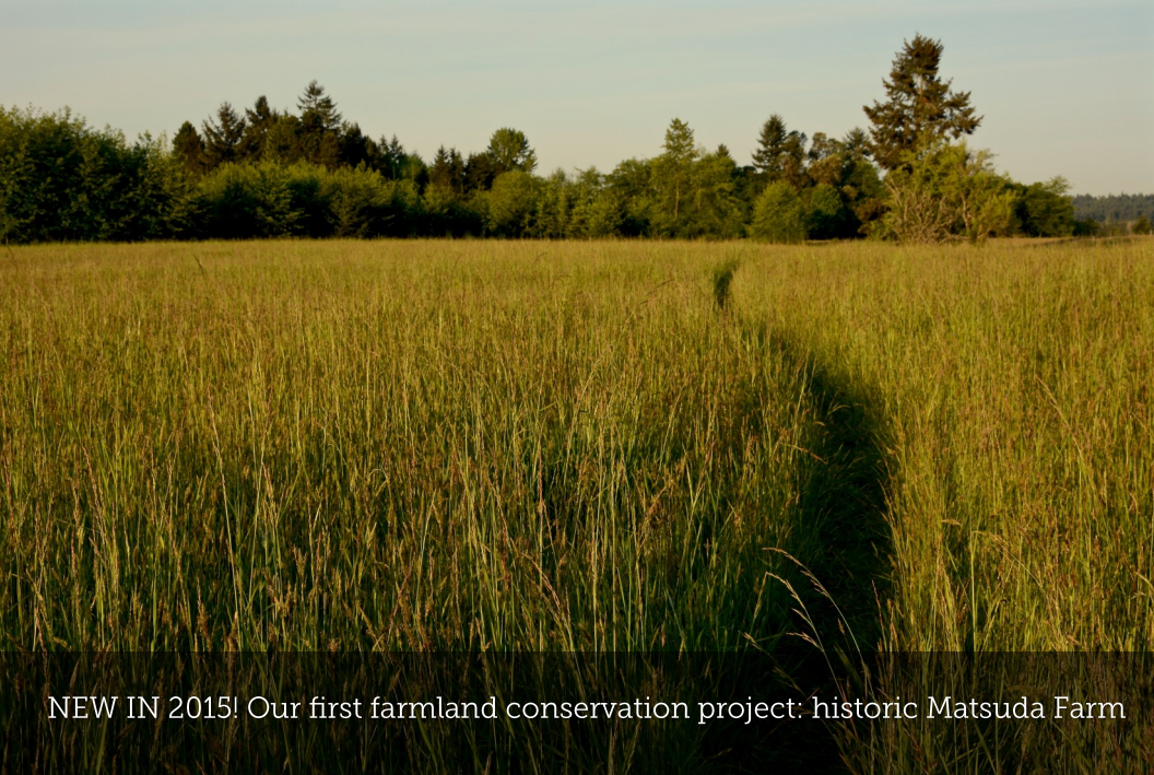
NEW IN 2015! Our first farmland conservation project: historic Matsuda Farm