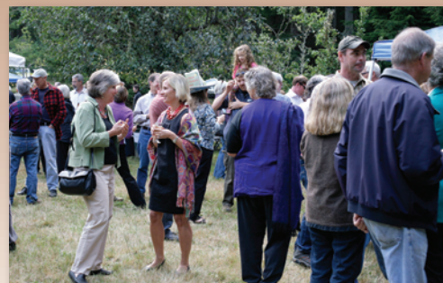
Partiers enjoy themselves at Salmon Chanted Evening.