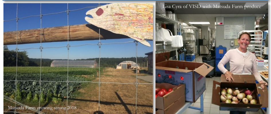
Matsuda Farm growing strong 2018