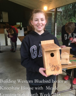
Building Western Bluebird boxes at Kneeshaw House with Meade Construction, Earth Week 2018