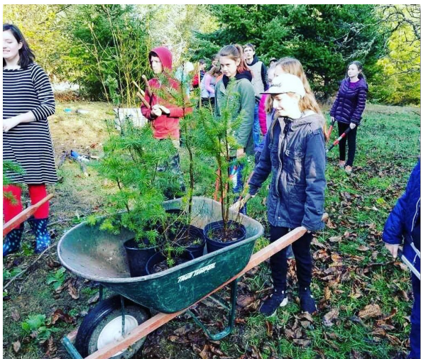
The Harbor School helping plant native trees.