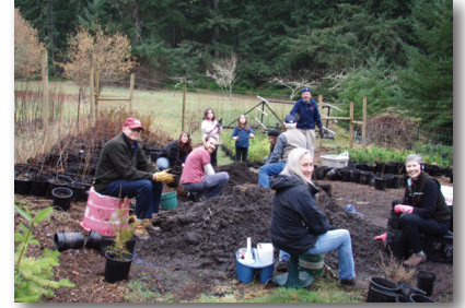
Land Trust volunteers nurture the next generation of island forest.

For information, call (206) 463-2644 or visit www.vashonlandtrust.org